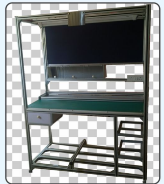
Customize Working Station