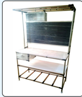
Working Table with Drover & Sample Box