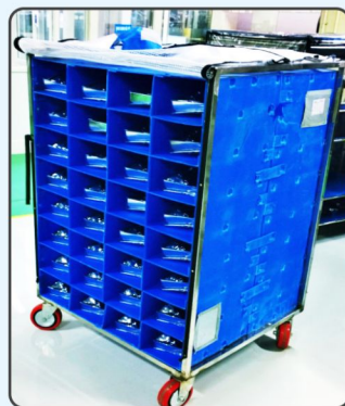
P.P. Cage Box Type Trolley