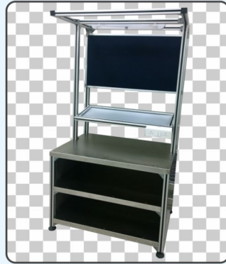
S.S. Sheet Base Working Station