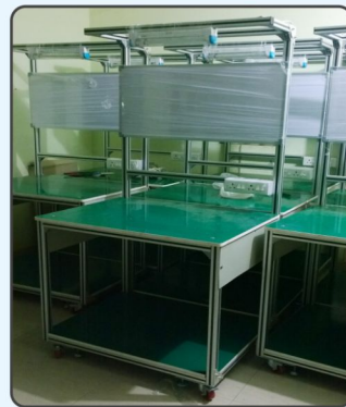
Moveable Working Table