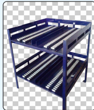
Roller Type Mold Rack (Fabricated Heavy Duty)