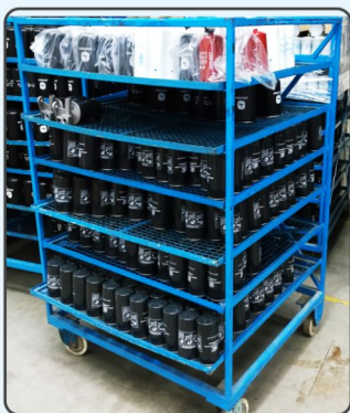
Wire Mess Trey Sliding Type Trolley