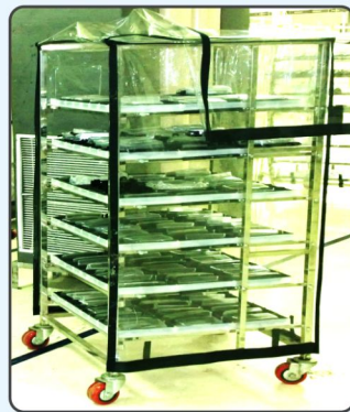
HDPE Trey Type Trolley