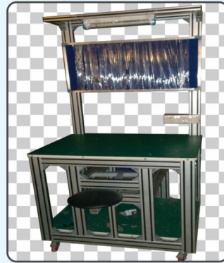
Working Table for Sitting Operation