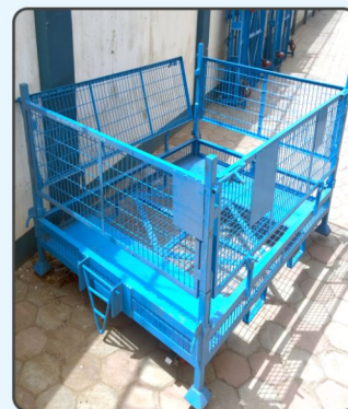
All Side Folded Type Trolley