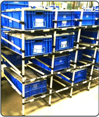
Bin Storage Rack (Round Powder coated Pipe)