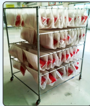
Cloth Pocket Type Trolley