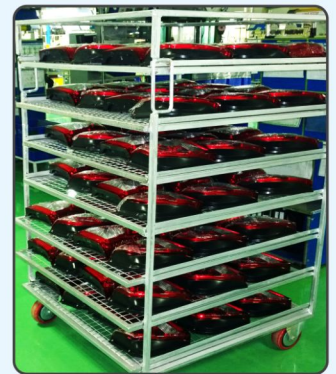
Double Sided Open Type Trolley