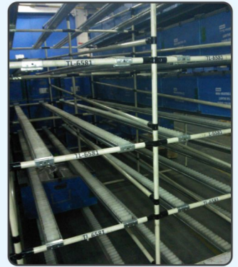
Fifo Rack for Store