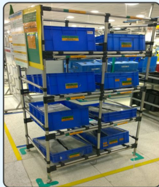
S.S. Round Pipe Bin Storage Rack