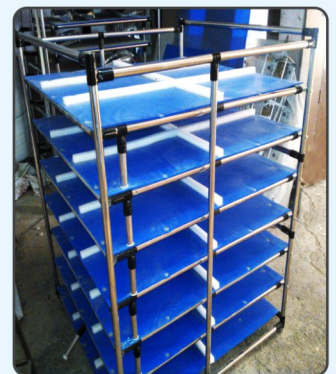
P.P. Corrugated Sheet Type Trolley