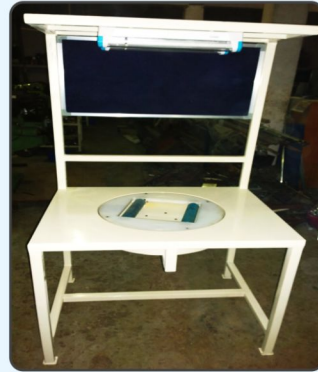
Rotary Table Fabricated Working Table