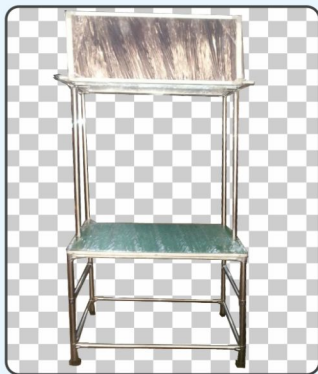
S.S. Round Pipe Jointing Clamp Working Table