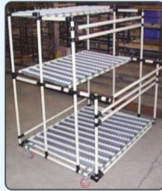
Roller Type Sliding Rack