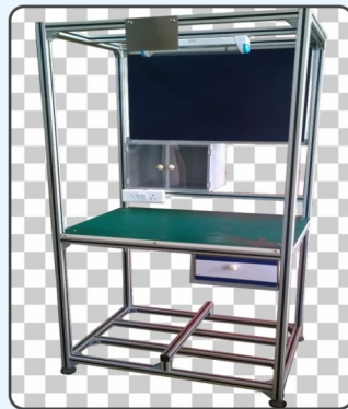
Working Table with all Accessories