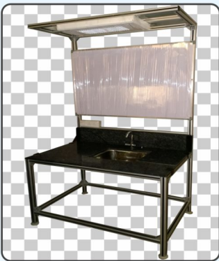
Component Washing Working Table with Stone