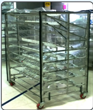
Soccer Type Trolley

With multiple quality checks placed at every step of the manufacturing process, we ensure that only the highest quality industrial hardware of international standards reaches our dedicated packaging unit. Here, it is handled and packed with care, so that it is ready to be delivered anywhere around the world in the same pristine condition that it has been manufactured.