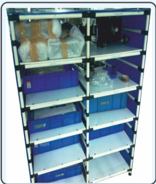
All Side Covered Material Storage Rack