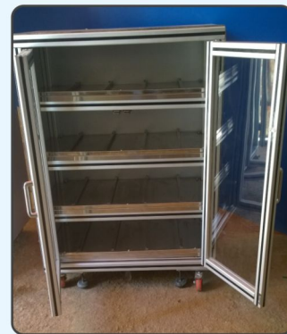
Aluminum Profile Almirah with Door