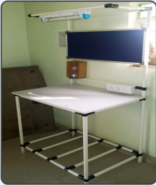
Clamp Jointing Round Pipe Working Table