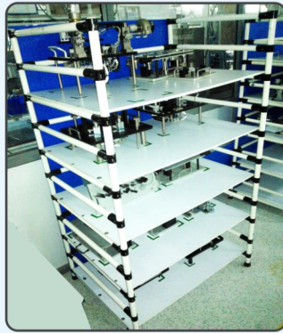
Jig-Fixtures Storage Rack