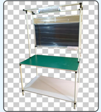
Double Step with Met Board Working Table