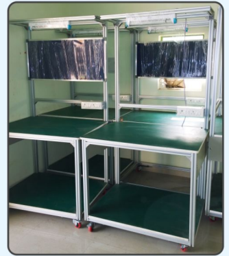
ESD Met with Grounding Working Stations